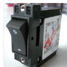
Switch Circuit Breaker